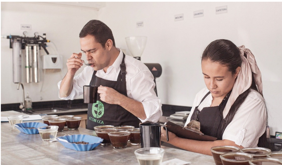
Coffee cupping process at the Café Condor processing plant in Huila