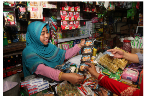
MSEs account for 99.9 per cent of the total number of enterprises in Indonesia and 91.7 per cent of total employment

Furthermore, it is also important to note that microcredits are in 30% of all cases used for consumption needs. This indicates that increased lending alone to MSEs does not automatically lead to more productive investments. Experience in other countries (e.g. India) showed that the proliferation of supply of microcredits did not take into account the capacity of the borrowers and led clients into over-indebtedness as well as a collapse of the microfinance industry. Microfinance should therefore be fostered with a view to balance both social and commercial objectives. The focus on clients’ needs to be put at the core of all microfinance operations (often referred to as ‘responsible finance’ practices) in order to ensure the sustainability of the industry.