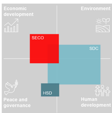
Figure 1: Synergies of the Swiss international development cooperation

SECO's activities are strategically aligned and operationally complementary to the activities of the Swiss Agency for Development and Cooperation (SDC), the Human Security Division (HSD) (cf. Figure 1) and other federal administration agencies, such as the Swiss Federal Office for the Environment (FOEN) and the State Secretariat for Migration (SEM). The goal of this strategic coordination and operational complementarity is to ensure maximum effectiveness and an efficient use of resources.